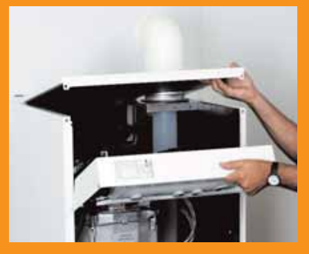
Open the housing and open the bottom-hinged controller box