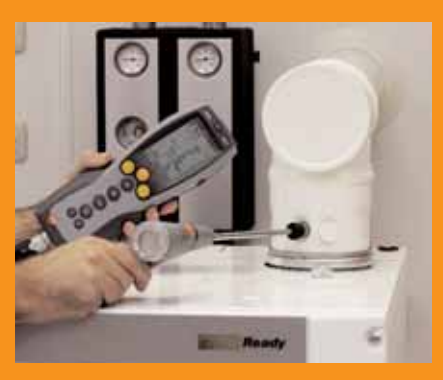
Install the housing and check the combustion parameters