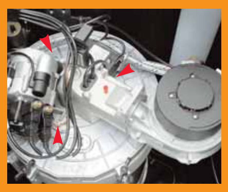
Remove 3 screw