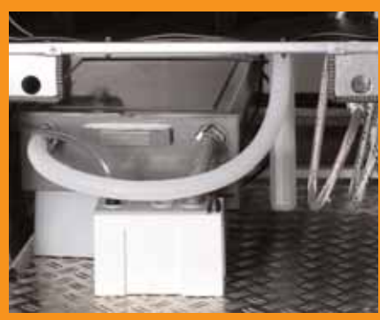
Clean the siphon, neutralisation unit and condensate pump