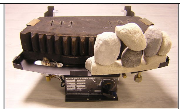
Figure 2. Fitting the front right hand base pebble.

Remove the two halves of the front base pebble from its protective packaging. Position the right base pebble in front of the burner as shown in figure 2. The left base pebble should be a tight fit. Because of this, the left side of the left base pebble should be located first (See figure 3). It may be necessary to gently push the two halves apart to locate the left hand base pebble (See figure 3).