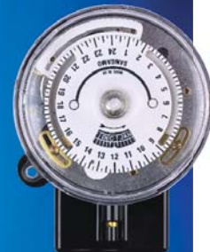
S250 Solar Series

Round Pattern Solar products are ideal for any application which requires control linked to Sunset and Sunrise times. Popular applications for solar time switches include street, stairwell and security lighting.