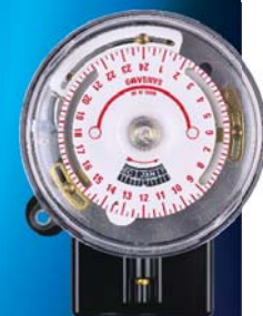
Q550 Solar Series

NB..... Base Pins - 3 Pin is for standard wiring, 4 Pin is Volt Free AC Contacts.