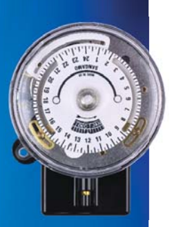
S250 Solar Series

Round Pattern Solar products are ideal for any application which requires control linked to Sunset and Sunrise times. Popular applications for solar time switches include street, stairwell and security lighting.