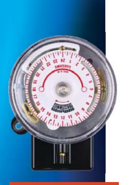
Q550 Solar Series