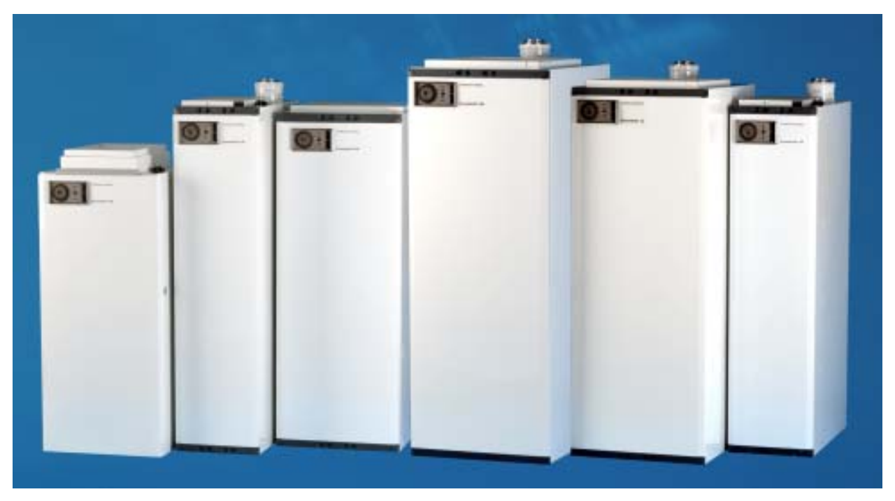
Complete Economaire range - from left to right:

IMPORTANT: IT IS A STATUTORY REQUIREMENT THAT ALL GAS APPLIANCES BE INSTALLED BY COMPETENT PERSONS, (i.e. CORGI REGISTERED INSTALLERS) IN ACCORDANCE WITH THE GAS SAFETY (INSTALLATION AND USE) REGULATIONS (CURRENT EDITION). FAILURE TO COMPLY WITH THESE REGULATIONS MAY RESULT IN PROSECUTION.