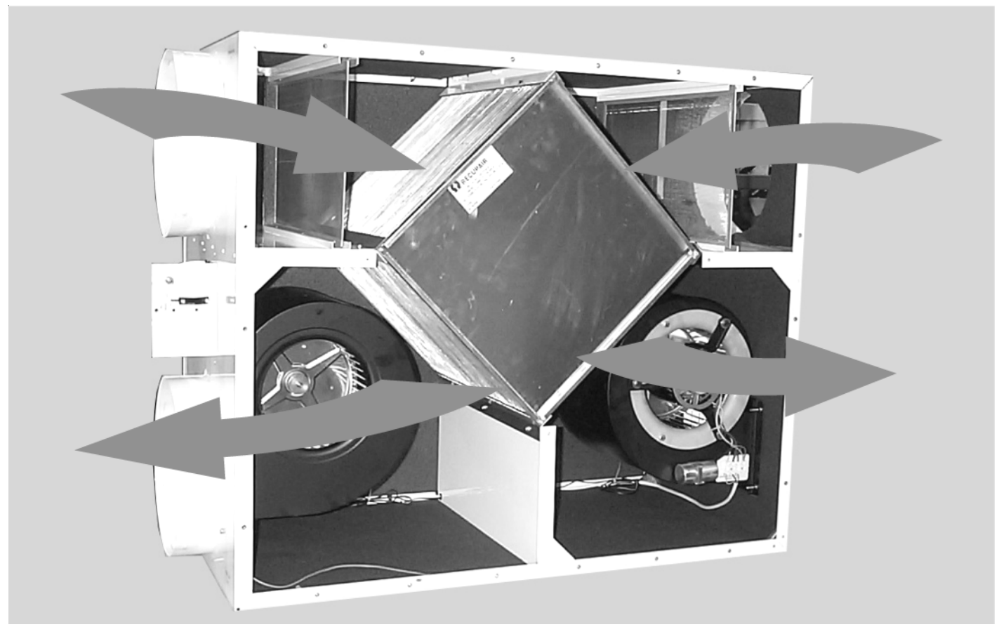
Fig. 1 HR600 Heat Recovery Unit

1.3 REGULATIONS: Installation shall be in accordance with the following regulations: