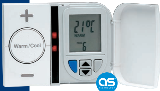
Flap open: For installer set-up