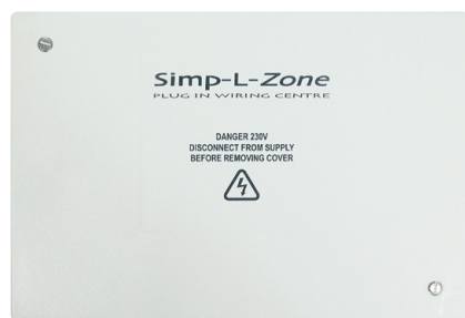
Plug-in Wiring Centre