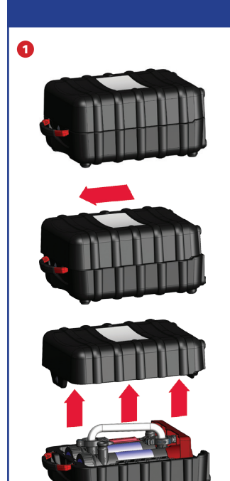
Lift the handle to unlock the box, slide and lift off the top case.