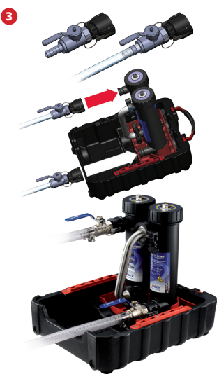
Remove the valve and camlock assembly from the parts box and attach to existing hose either from the MagnaCleanse connection kit or hose from your existing PowerFlush machine.