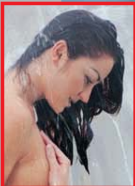
...the benefits of hydromassage...