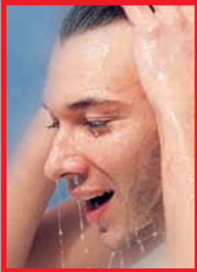
The relaxation of a hot shower...