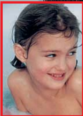
...the joy of children in the bath.