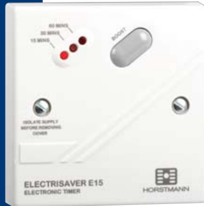
Choose from 15, 30 or 60 minute durations