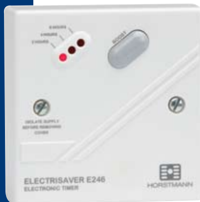
Choose from 2, 4 or 6 hour durations