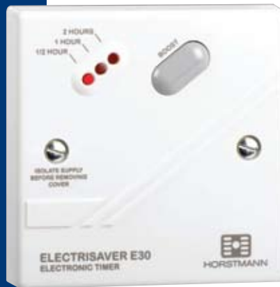
Choose from 30, 60 or 120 minute durations