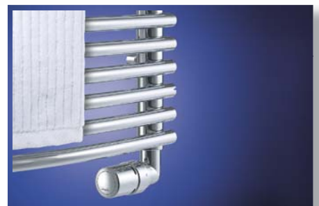
RA-URX in Situ