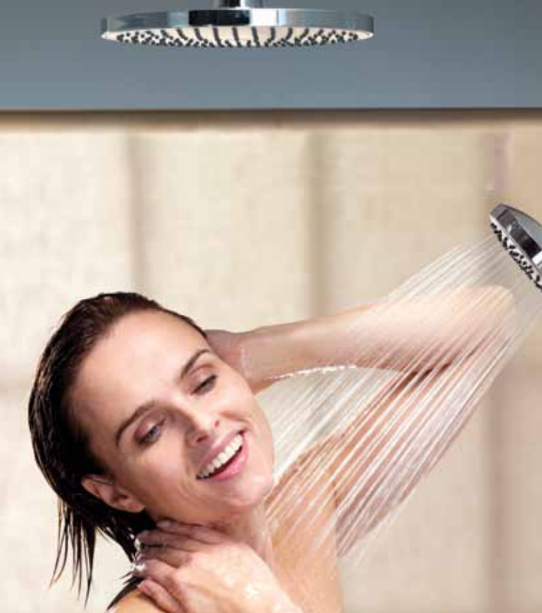
The adjustable height handset