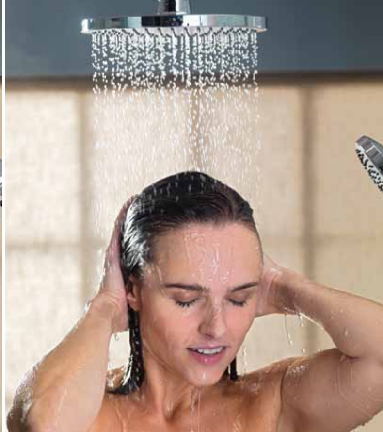
The 220mm drencher head provides a luxurious soak