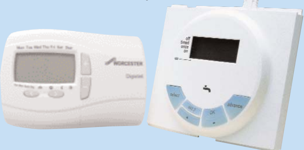
Worcester D10RF Digistat 24-hour programmable room thermostat

Consequently if you require the temperature in the house to be at a certain level first thing in the morning, the programmer needs to bring the boiler on at least 30 minutes before that time. Please note that the actual time of the programmer will require resetting at the start and end of British Summer Time, unless it is one of Worcester's latest programmers that does this automatically.