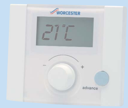
Worcester RT10 room thermostat

The room thermostat dictates how hot the air temperature in the house will be. Generally the thermostat is sited in the hall or landing or in an unheated room. They can be either mechanical (with a dial) or digital. For the